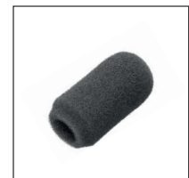
3M™ PELTOR™ Wind shield M171/2