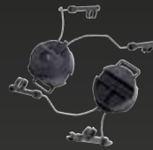
P3ADG-F SV/2 Rails attachment