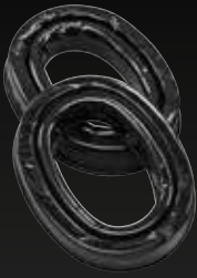
HY80-EU Gel cushions