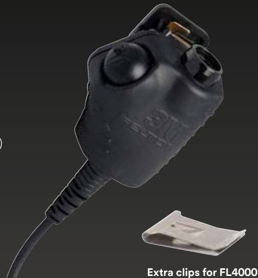
Extra clips for FL4000